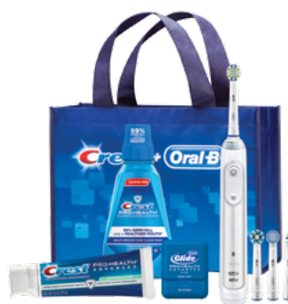
Crest® + Oral-B® Gingivitis System*