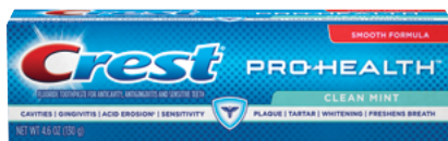
Crest® PRO-HEALTH™ Clean Mint Smooth Toothpaste

We recommend these Crest® + Oral-B® products to help keep your gums healthy: