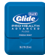
Oral-B® Glide™ PRO-HEALTH™ Advanced Floss